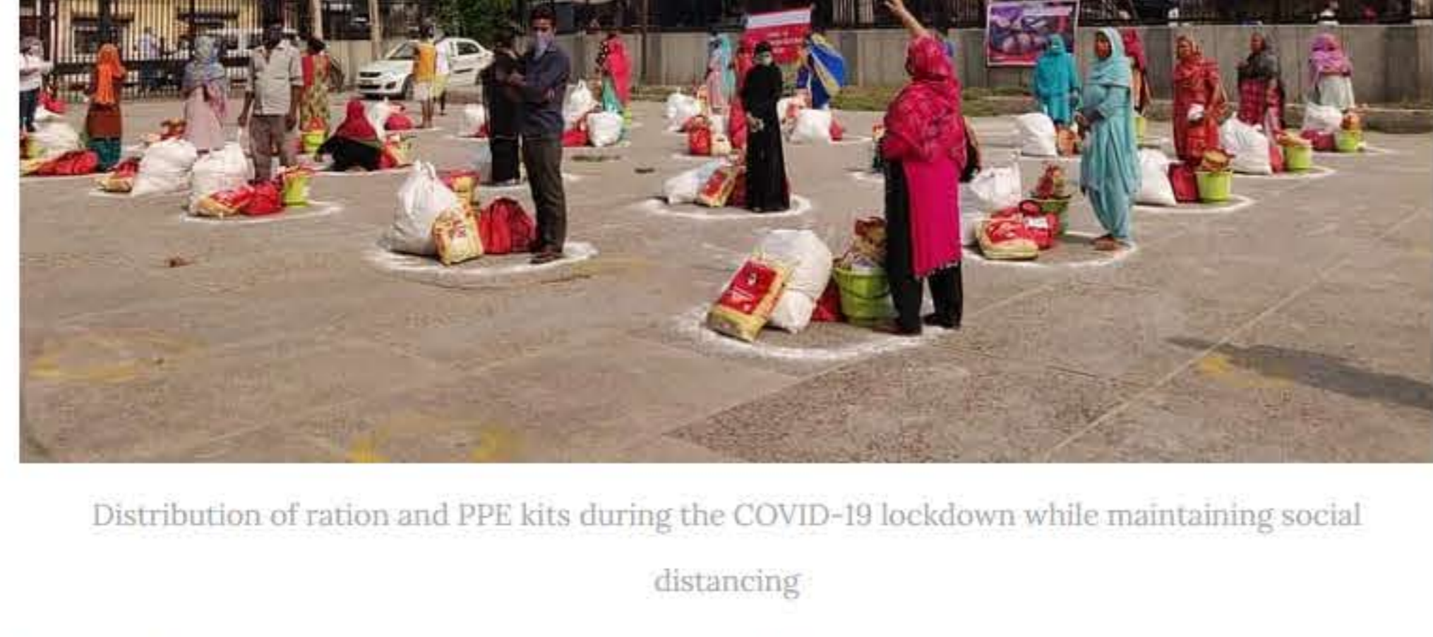
Distribution of ration and PPE kits during the COVID-19 lockdown while maintaining social distancing

With a goal to help at least one billion people , the foundation analyses the root causes of socio-economic challenges in developing countries.