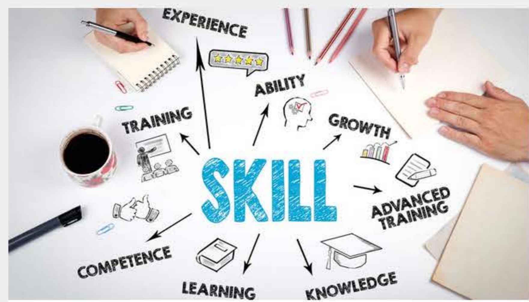
WITH proper training and development, weakness can turn into strengths and your employees can excel