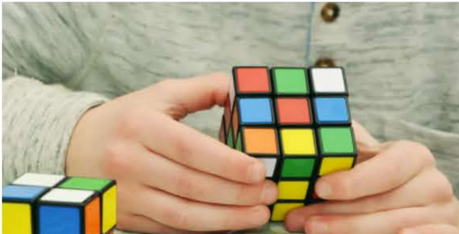
5 online upskilling courses to boost your career

India Today Web Desk New Delhi July 12, 2021 UPDATED: July 12, 2021 12:23 IST