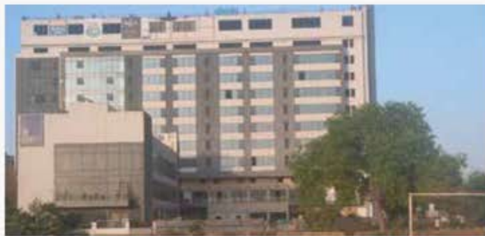
Delhi-NCR office building

Clearly, elevators are now an indispensable part of the modern-day infrastructure, only growing more robust, sleek and innovative. From enabling people to climb multi-story buildings in a matter of minutes to transporting big cars to the top floor, elevators have come a long way from being a simple pulley-lever system.