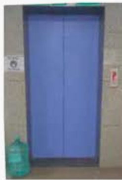
Elevators are a key factor during an office space search.

Of course, it could be a coincidence or an aspect of project maintenance that exemplifies life in the "new normal," post-COVID era we are facing at present. For me, it provided a hitherto unnoticed indicator, which seems capable of redefining the office search process, especially given that the process of shortlisting offices gets managed largely on the basis of images and videos, with actual site visits being few and far between.