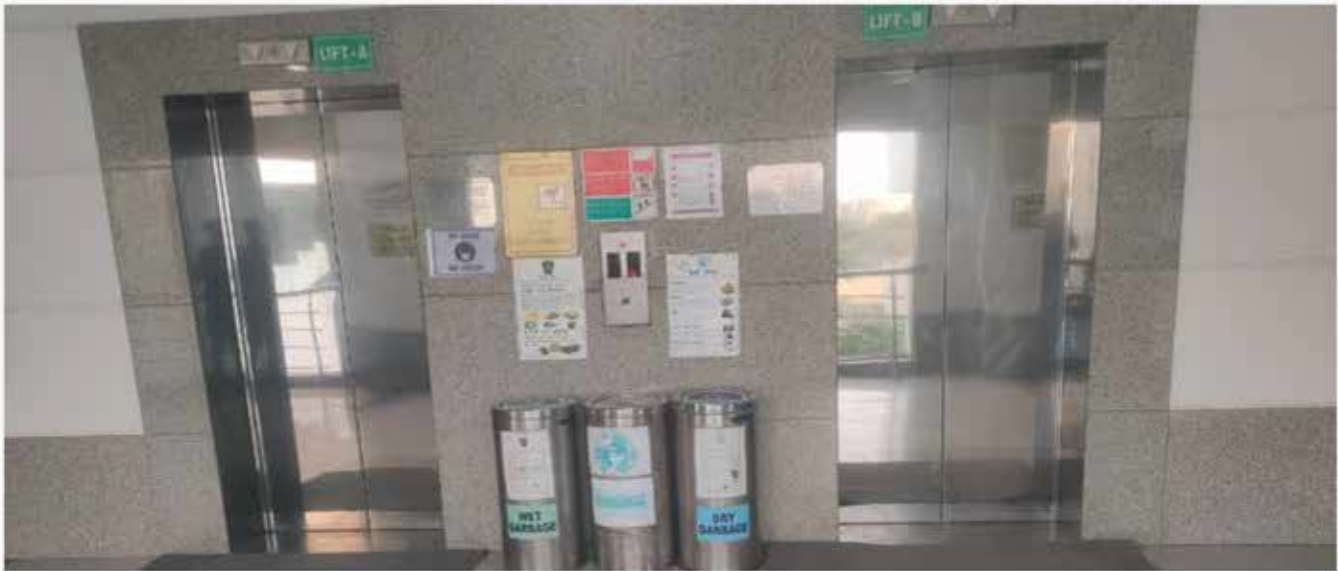
Elevator in an office building

regularly handle the influx and outflow of people working in your office.